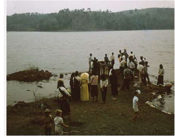
"Sea Lake Pleiku 1966 - Missionary Baptism - Lễ rửa tội ở Biển Hồ Pleiku năm 1966"

Then the seventh angel sounded: And there were loud voices in heaven, saying, "The kingdoms of this world have become the kingdoms of our Lord and of His Christ , and He shall reign forever and ever!"